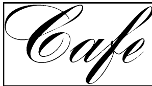
Sign with background or borders