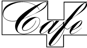
Individually lettered sign